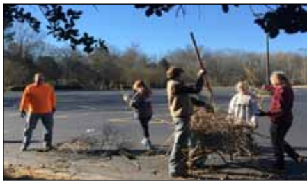
Student volunteers on the Providence Campus.

Our students have embraced MissionDays! Not only are they learning about service and the sense of accomplishment it brings, but they are truly being the hands and feet of Jesus to multiple organizations!