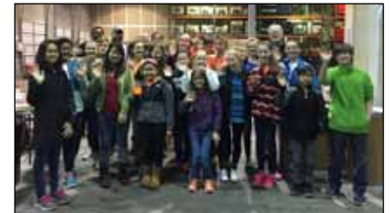
Our gang serving at Loaves and Fishes.

Our students were there to weigh, sort and organize pounds and pounds of canned goods. “Oo-rah, Students!”