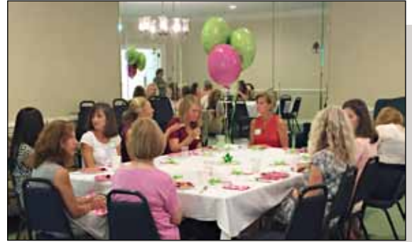
MOMs Group women enjoy brunch and each other's company.

This group offers a nurturing and supportive environment for women who find themselves in a tender, yet tumultuous, time in their lives. Many mothers have found solace and support, friendship and freedom, direction and discovery here. In short, MOMs Group is a lifeline for mothers who just need to know they are not alone in their struggles and stresses.