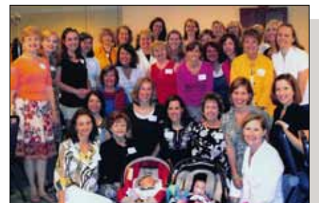
MOMs Group 2008

Your giving transforms lives on a daily basis, even when you can't see it.