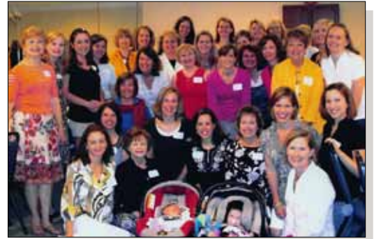
MOMS Group Mother's Day Brunch - circa 2009

HELP US GET THE WORD OUT! INVITE A MOM! Better yet, bring her yourself!!