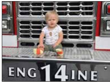
Fire Truck Day