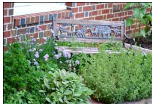
Fresh herbs growing in the Friendship Garden