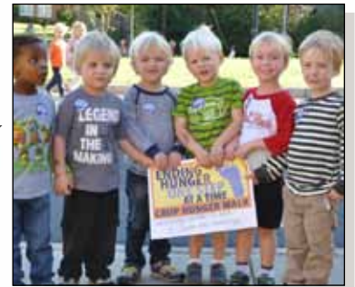
Our children doing their part

Then, be on the lookout for how you and your family can participate in this year's Charlotte CROP Walk. We highlight how each of us can make this world a better place by engaging in big and little events. The