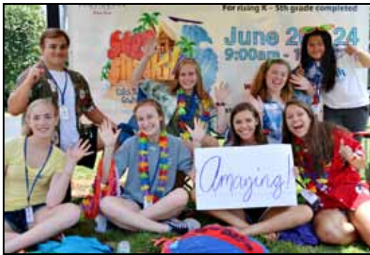
High School students volunteer during VBS.

“VBS is important to me because I hear and learn more about Jesus and the different ways he shows us love. My favorite part of VBS is singing and helping others around the world. I get excited to make things in the fellowship hall. We make things - like a cross necklace - that remind me Jesus died for us so that our sins could be taken away. I am excited when dad says we are going to VBS again each year because I know it will be fun seeing our friends from Charlotte.”