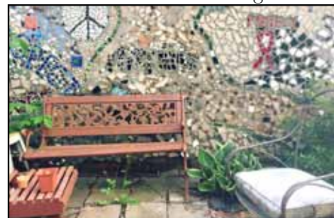
A lovely seating area at QC Family Tree, an oasis of green in the Enderly Park neighborhood.

need and my lack thereof. And then I'm overwhelmed by replication of this in neighborhoods where there is no QC showing people that they are loved and valued just as they are.