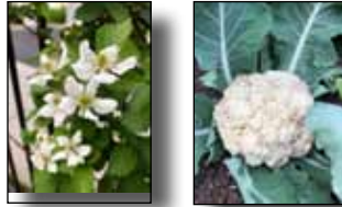
Raspberries bloom and cauliflower heads ripen. Our garden is a winner.

If you need access to fresh vegetables, reach out to our ministry team and we will get you in touch with our garden team.